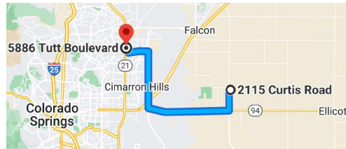
Approximately 22 minutes from the field.

24 Hour Emergency Vet – Call First Powers Pet Emergency and Specialty 5886 Tutt Blvd, Colorado Spring CO (719) 473-0482